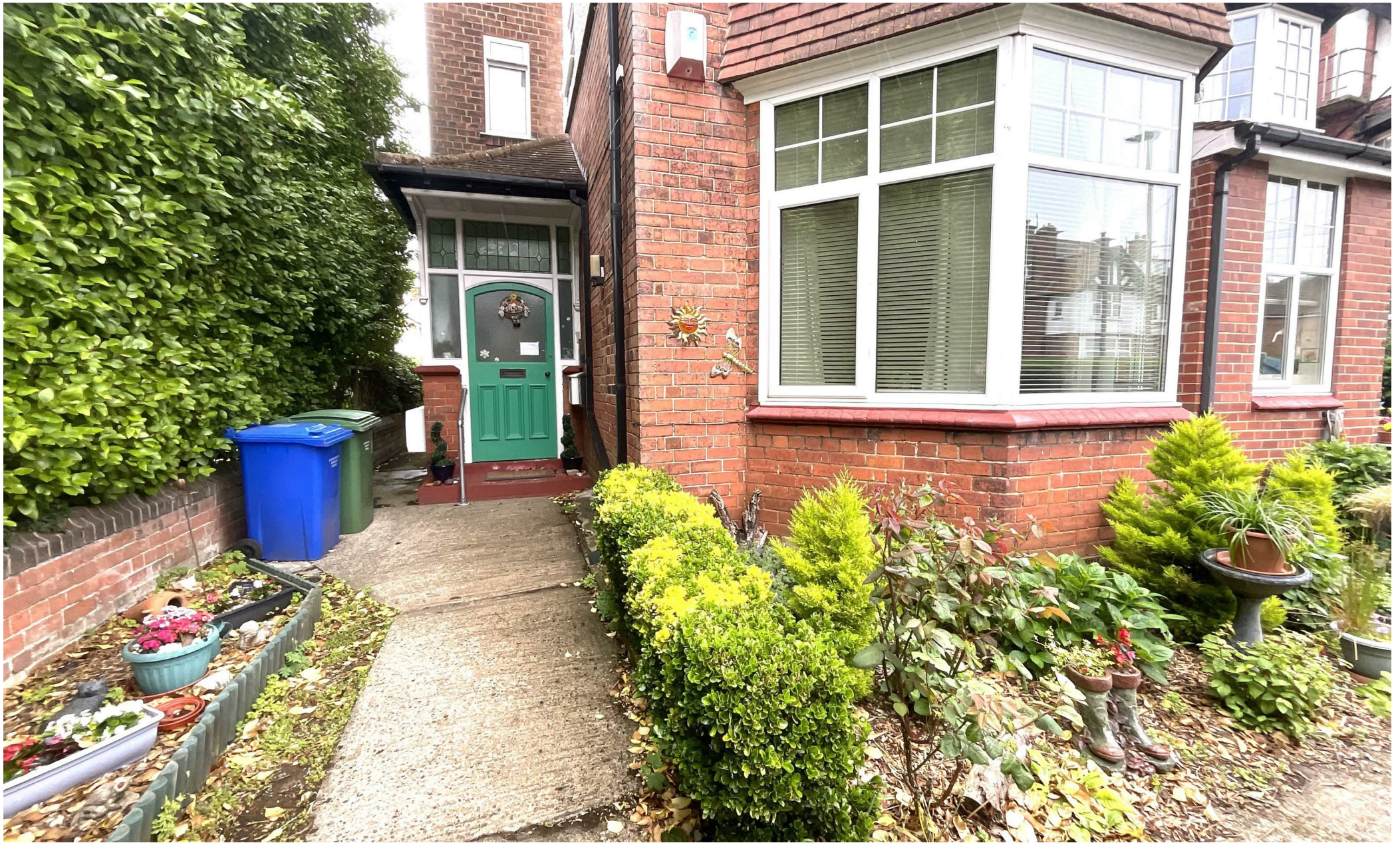
27 Holbeck Avenue, Scarborough YO11 2XH £850